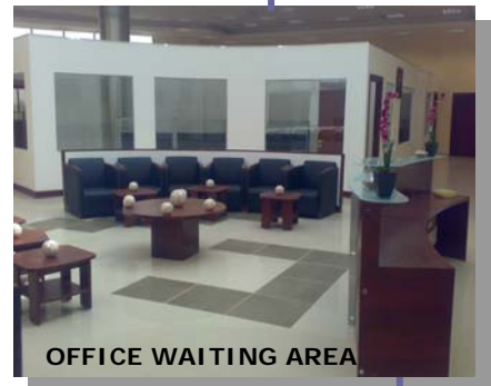
OFFICE WAITING AREA