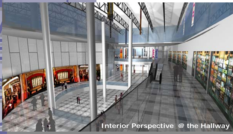
Interior Perspective @ the Hallway