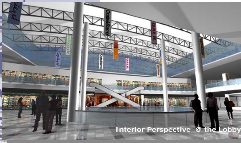
Interior Perspective @ the Lobby